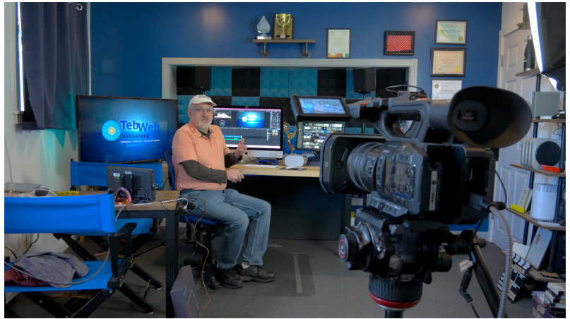
RECORDING A 2-5 MINUTE VIDEO TO TRAIN THE AI SYSTEM.

We come to you, and record a few minutes ad libbing to the camera. We can film you in a number of outfits for different looks, and even bring a portable green screen to create digital backgrounds.